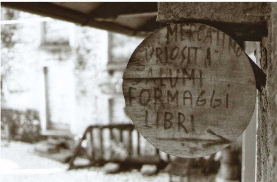
a wooden sign in the village says: small market, quirky things, salami, cheese, books | ilford 125