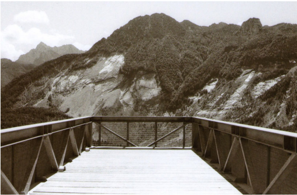
the view from the former elementary school of Casso, currently exhibition space of the Dolomiti Contemporanee project | ilford 125