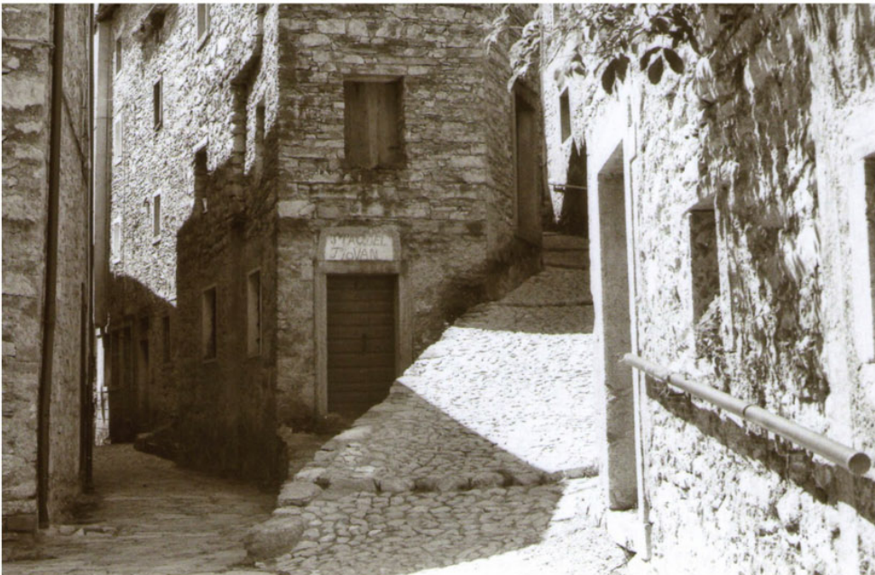
Casso alleys | ilford 125

the dam was almost undamaged, so it still stands there, like a huge gravestone. empty, grey, silent.