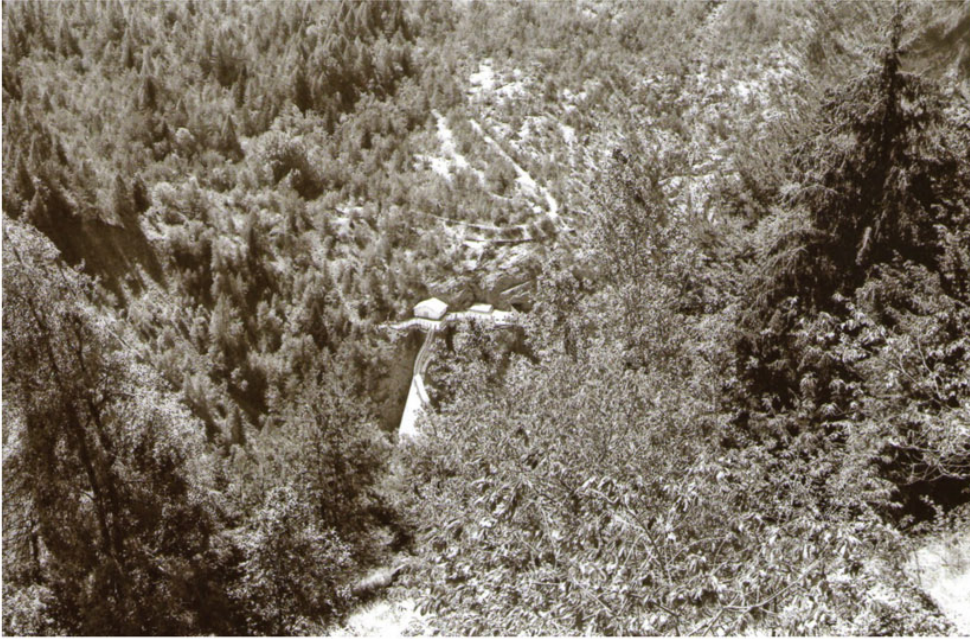
the Vajont dam seen from Casso | ilford 125

the same film i shoot in Sarajevo has been used during a lambretta ride to Casso, an hamlet located in the Friuli mountains, about 130 km northwest of Trieste, and about 50 km from our home.